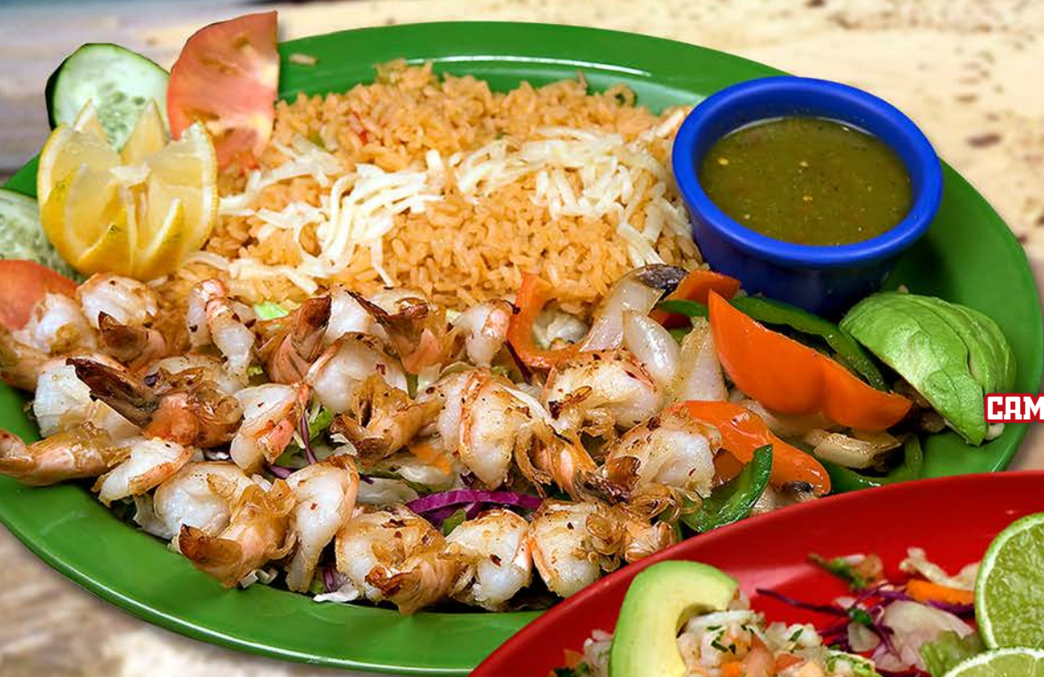
CAMARONES A LA PLANCHA

*Contain (or may contain) raw or undercooked ingredients. Consuming raw or undercooked meats, poultry, seafood, shellfish or eggs may increase your risk of foodborn illness, especially if you have certain medical conditions.