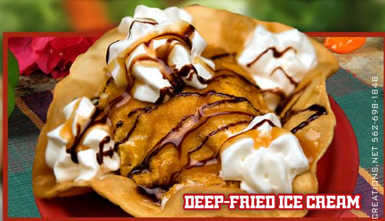
DEEP-FRIED ICE CREAM