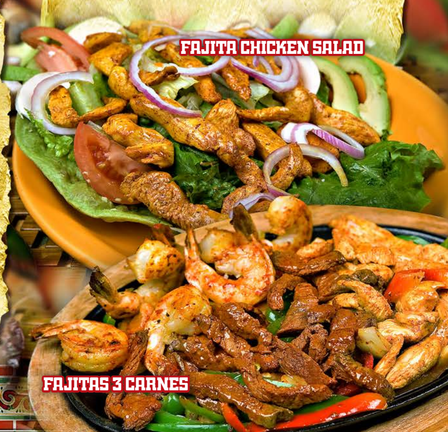
FAJITA CHICKEN SALAD