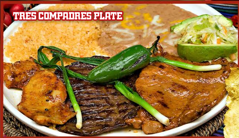
TRES COMPADRES PLATE

*INCA PLATTER..... Marinated skirt steak and shrimp. Sautéed in our famous garlic butter or a la diabla sauce served with rice, beans, guacamole.