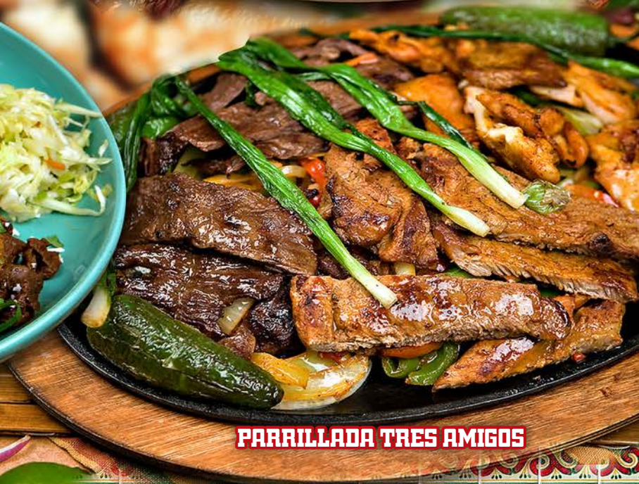
PARRILLADA TRES AMIGOS