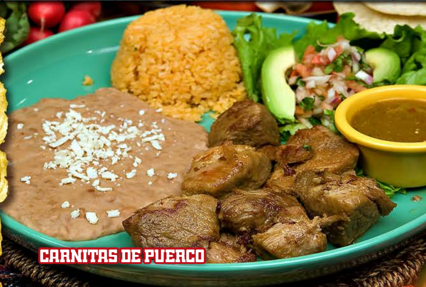
CARNITAS DE PUERCO

Carnitas are marinated pieces of pork meat. Slow cooked in copper cauldron until tender juicy and golden outside. Served with rice, beans, avocado slices and our special spicy sauce.