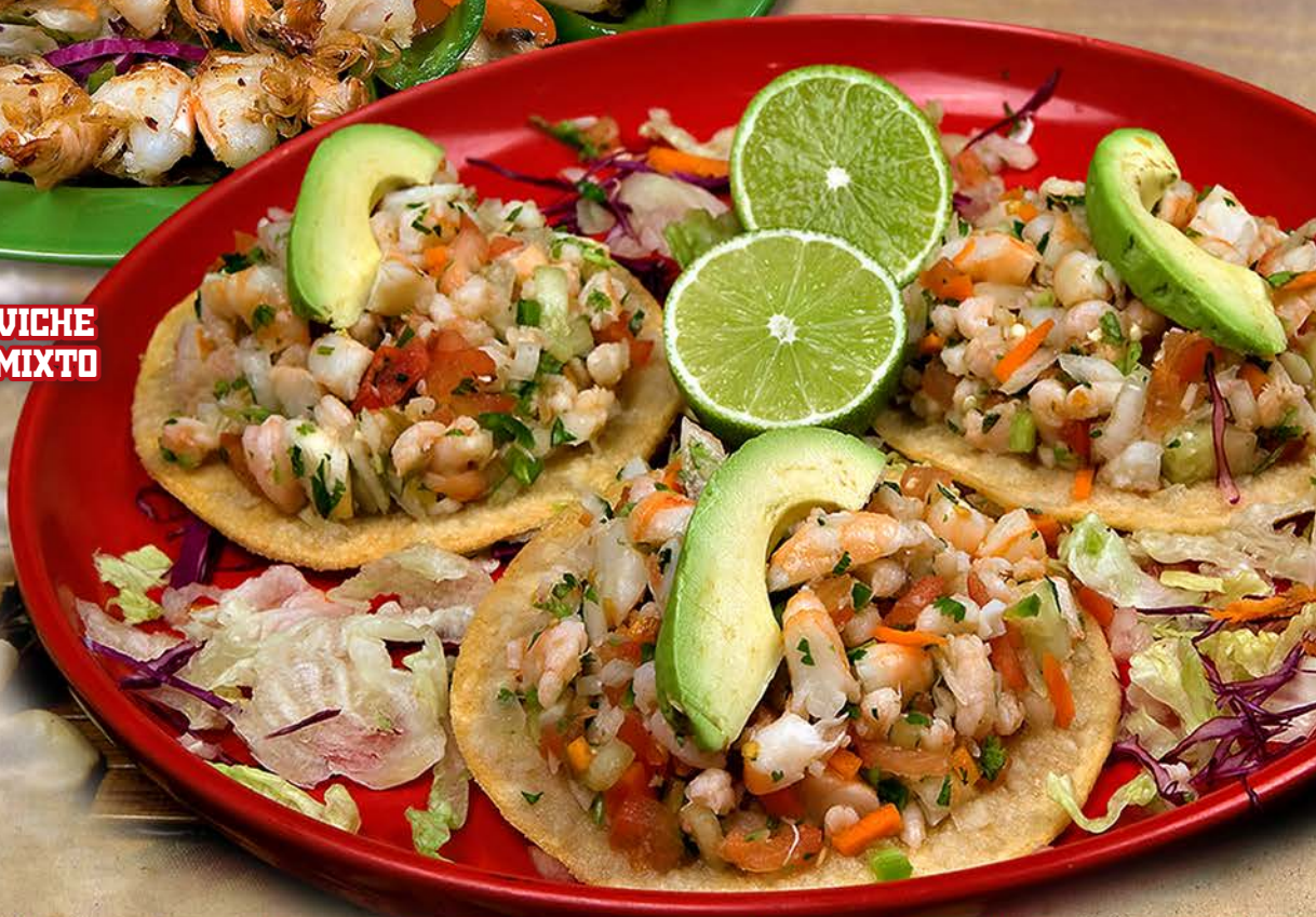
TOSTADA DE CEVICHE DE CAMARON O MIXTO