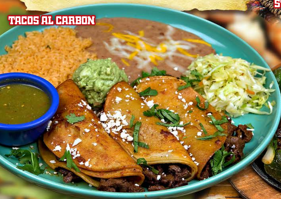
TACOS AL CARBON

Top sirloin steak char-broiled topped with mushrooms, tomatoes, onions, bell peppers, jalapeños and a special, somewhat spicy Mexican sauce. Served with guacamole.