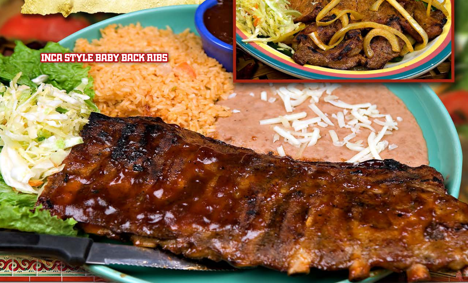
INCA STYLE BABY BACK RIBS